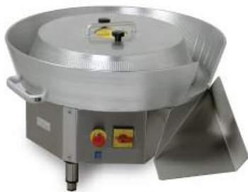
^ DR42 PizzaExpress™

The vertical sheeter has been designed for rolling pasta in settings where space is at a premium. Both practical and easy to use, its unmatched versatility allows you to sheet pizza dough, square pan pizza, puff pastry and fresh pasta with equal effectiveness.