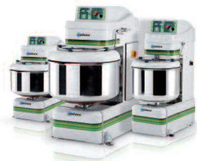
^ Greenline Mixers GL50/GL80/GL120