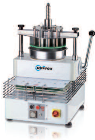
^ DR14 Divider/Rounder