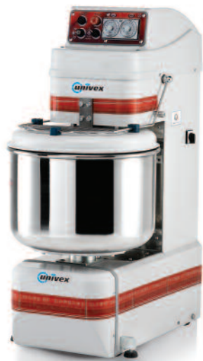
^ Silverline Mixers SL160/SL200/SL280