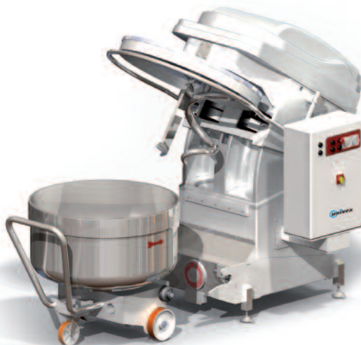
^ Silverline Mixer with removable bowl

Designed for industrial bakeries, these sturdy, reliable mixers feature dual motors and an electromechanical control panel with rubber gaskets. The bowl is blocked by a high-powered electromagnetic system for reducing noise and wear during kneading. Available in models suitable for 80 up to 300 kg of dough.