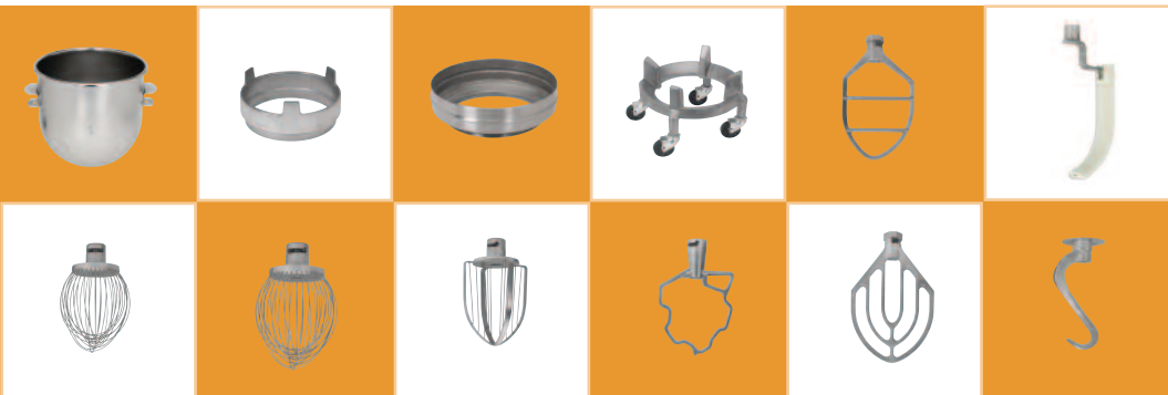
SS Bowl Bowl Truck Adapter Splash/Ext. Ring Bowl Truck Pastry Knife Bowl Scraper SS Wire Whip Heavy-Duty SS Wire Whip Four-Wing Whip Sweet Dough Beater Batter Beater Spiral Dough Hook