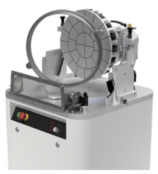
2. Remove the ring and clean it inside with a plastic scraper.