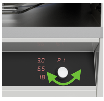
3. Set the pre-selected program for the working cycle see chap. 7.4.1