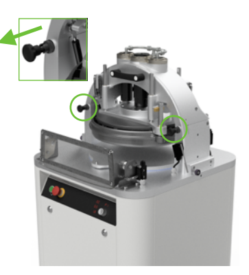
2. Open the fastening thrusts (x2)