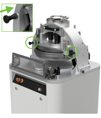
7. Close the fastening thrusts (x2)