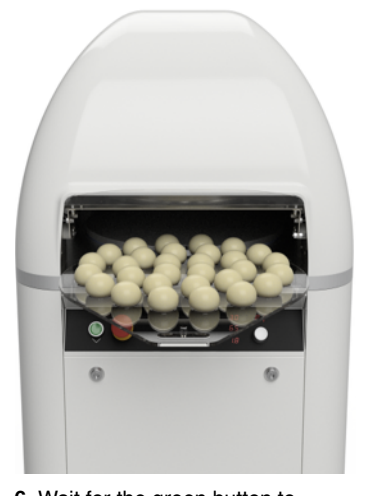
Wait for the green button to flash;Open the guard casing and remove the plate with shaped balls