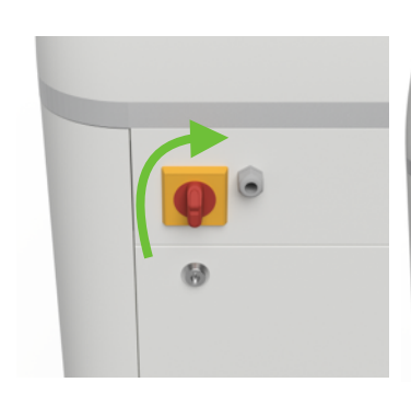
1. Position the main switch in the I ON position

The phases follow for correct use of the rounding divider