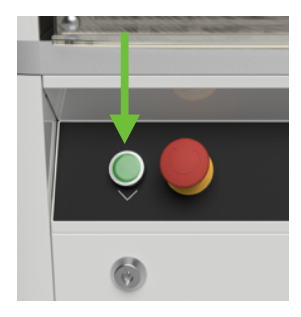
5. Press the green Start key