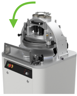
Close the cutting unit accompanying it to the support and close the fastening thrusts (x2)