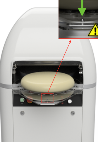
Insert the plate with the weighed dough inside the machine, paying attention you insert it correctly