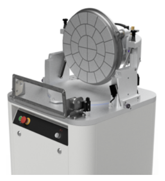
Once the knives are clean, press the Start key again and the knives return to position