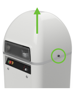
Remove the upper casing by unscrewing the specific fastenings (x2)

To clean the machine daily, follow the phases as outlined below