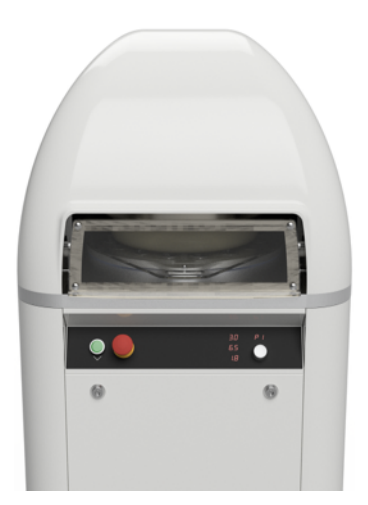
4. Close the guard casing