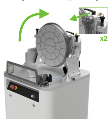
Open the cutting unit accompanying it to the support. Remove the ring fastenings (x2)

Having removed the upper casing as previously described, continue as illustrated