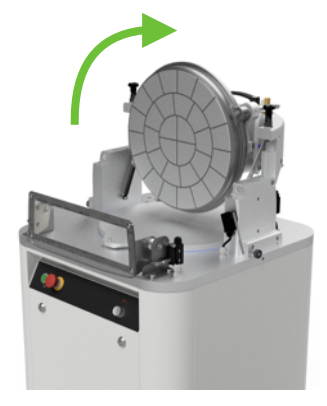
Open the cutting unit accompanying it to the support