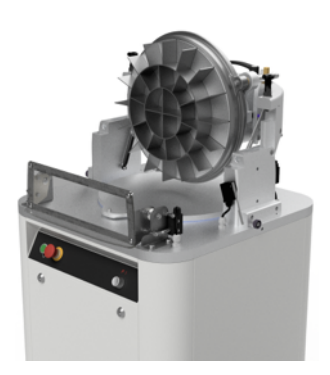
4. Press the "Start" button "a"; the knives will exit the machine for cleaning

The machine will automatically display the "CL" cleaning program as shown in the image below