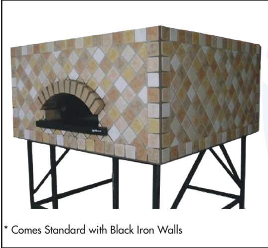
* Comes Standard with Black Iron Walls