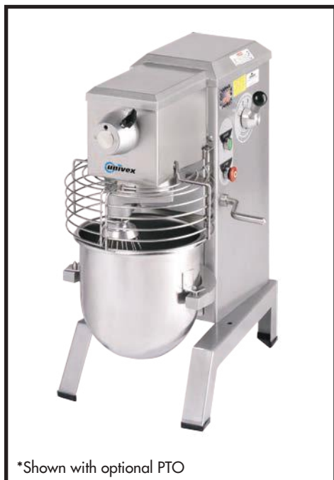
*Shown with optional PTO