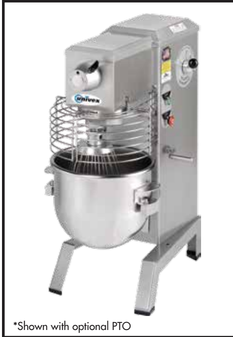
*Shown with optional PTO