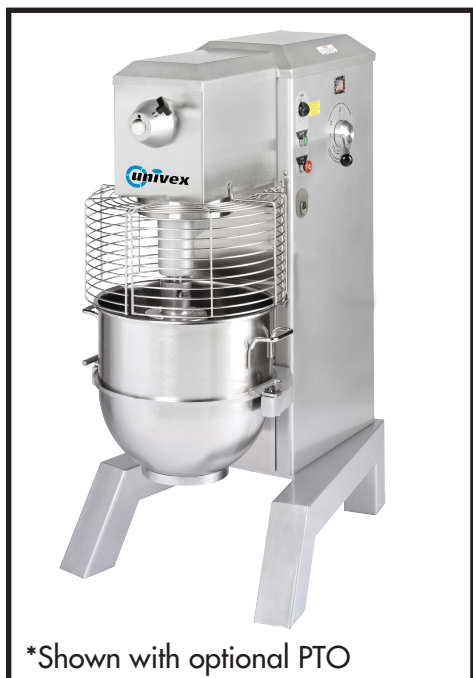
*Shown with optional PTO